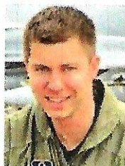
#2, "To Forgive the Past" (Mark's Story)