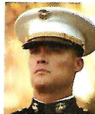
#4, "A Mate for the Lone Wolf" (Luke's Story)