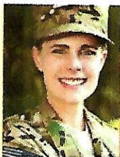
#1, "Loving What's Left" (Kit's Story)