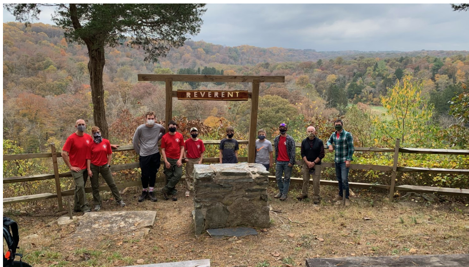
Scenic Overlook on the Hike

Troop 12 weekend past October the Hawkeye Camp Ware. attended by 5 plus former eagle, John who joined us night all day Camp Ware, the west side Octoraro Peach Bottom,