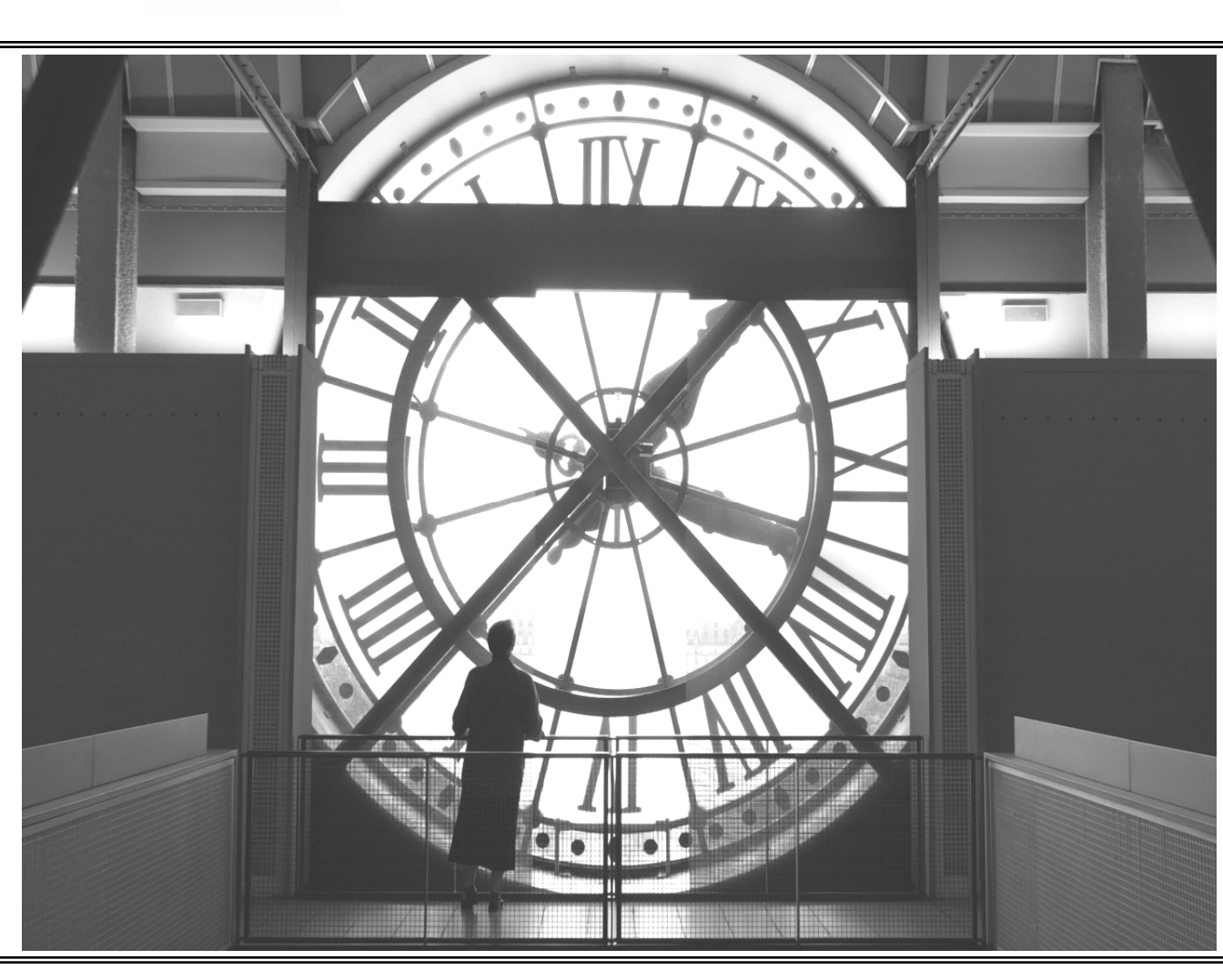
Seventeenth Sunday After Pentecost October 5, 2014

The Reverend Monica B. Guepet 300 North Guernsey Road West Grove, PA 19390