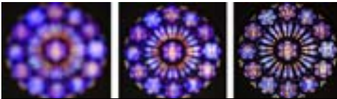
Coming into focus - Rose window, from Art in the Christian Tradition

Millard Sheets, (1907-1989). Word of Life mural, 1964