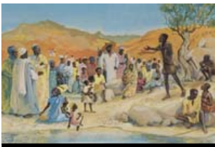
John the Baptist preaching in the desert

WEDNESDAY: Scripture: “During the high priesthood of Annas and Caiaphas, the word of God came to John son of Zechariah in the wilderness. He went into all the region around the Jordan, proclaiming a baptism of repentance for the forgiveness of sins,” Luke 3:2-3 Devotion: John came before Jesus, calling people to prepare for Jesus. He called the people to repent and believe. Repentance is turning away from that which you have done wrong. When we say sorry and continue to repeat our actions, we do not repent. True repentance requires our change. As we prepare for the coming of Christ, we must repent and believe.