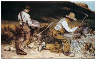
Gustave Courbet. The Stone-breakers . 1849. Destroyed 1945.

Prayer: Refining God, we tremble at the idea of you as one who reshapes us and yet, this is exactly how shape us and the world into your kingdom. We pray for your kingdom to come as it is in heaven. Amen.